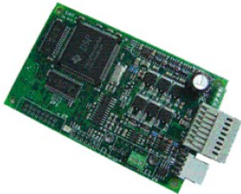
Intelligent Control Module